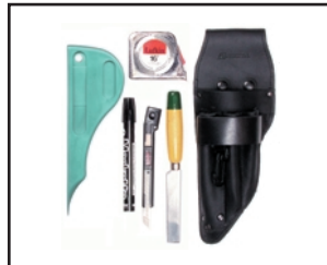
Paper Stripper Holster – Plus