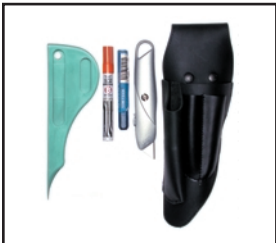
Paper Stripper Holster – Basic