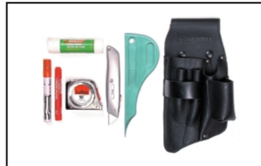
Paper Stripper Holster – Deluxe